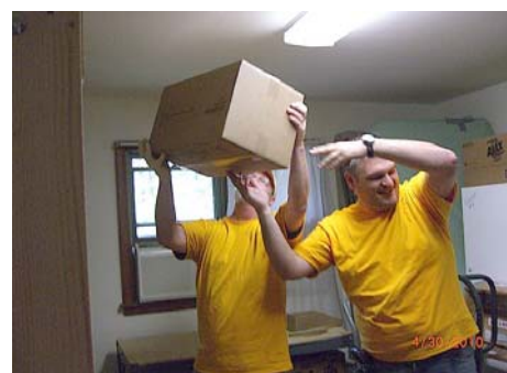
Teamwork made every job easier, from building the shelves to stocking them with donated food.

INTERNATIONAL POLIO AWARENESS DAY October 24, 2010